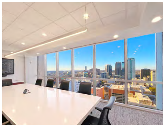
Unparalleled Scenic Views of UAB and CBD